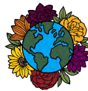
Photo credits were given where possible. Descriptions were edited either from destination-specific websites or online open resources such as Wikipedia and travel sites.